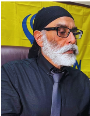
Khalistani leader Gupatwant Singh Pannuh