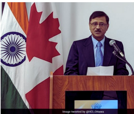
SFJ protests disrupt event attended by Indian envoy to Canada