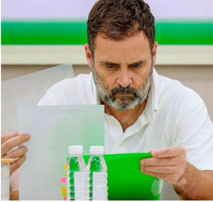
Rahul Gandhi Targeted by Khalistani Protesters at University of Cambridge, UK