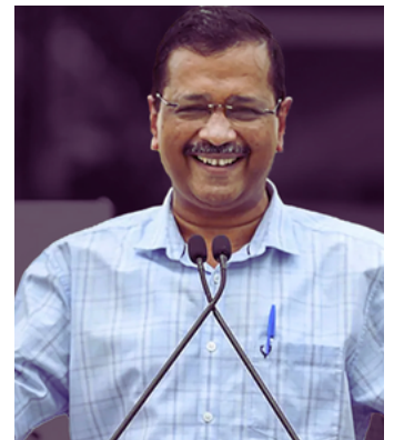
Chief Minister Arvind Kejriwal