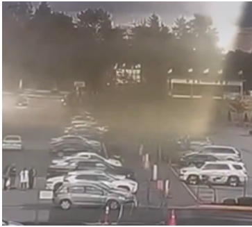
CCTV footage of pro-Khalistan figure Hardeep Nijjar's killing made public in Canada