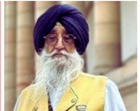
'Rail roko' stir: SAD (A) Sangrur MP Simranjit Singh Mann