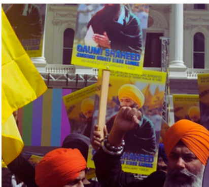
Khalistan Referendum event in California, US