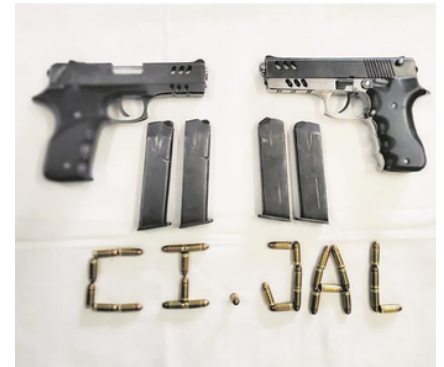
Two Babbar Khalsa International (BKI) operatives nabbed, planned targeted killings