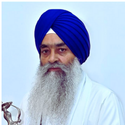
Akal Takht Jathedar warns of serious consequences in case of any loss of life to Amritpal Singh or his family members