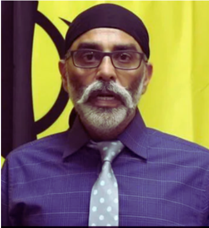
Khalistan terrorist Gurpatwant Singh Pannun