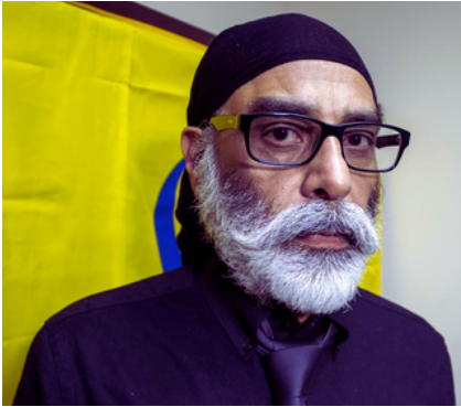
Sikh separatist leader Gurpatwant Singh Pannun