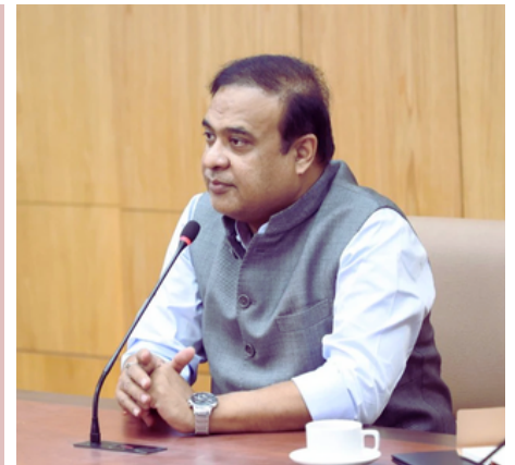
Assam CM Himanta Biswa Sarma