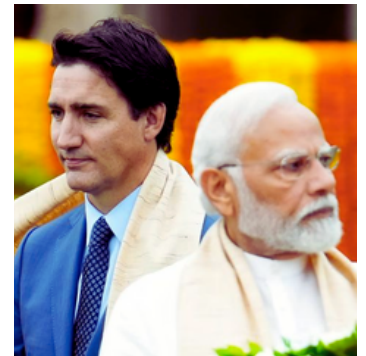
Narendra Modi Directly Involved in Murder Plots of Sikh Activists Abroad: Canadian Documentary