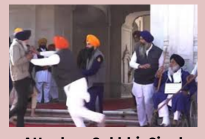
Attack on Sukhbir Singh Badal