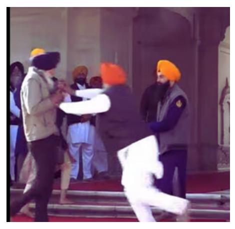
Sukhbir Singh Badal survives assassination attempt