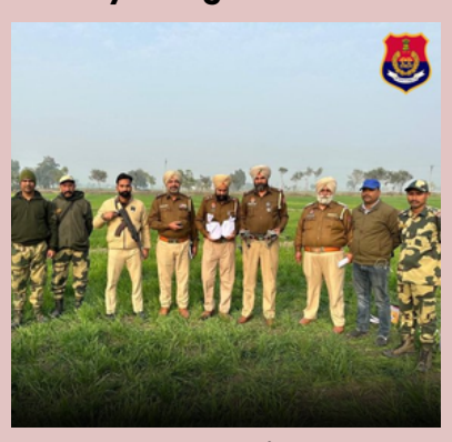
Tarn Taran Police & BSF recovered heroin and drone