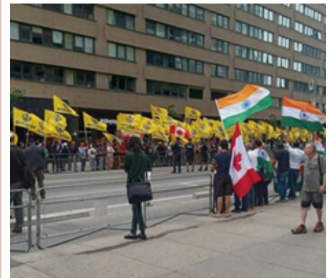
Pro-Khalistan protesters stage demonstration against Indian diplomat in Canada