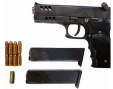
Member of Babbar Khalsa International (BKI)-backed terror module arrested in Amritsar