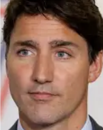
Canadian Prime Minister (PM) Justin Trudeau