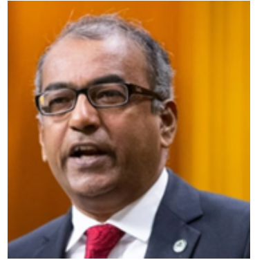
Liberal Member of Parliament (MP) Chandra Arya