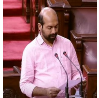
Member of Parliament (MPs) V. Sivadasan