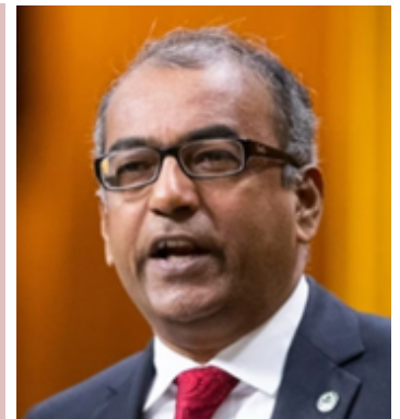
Hindu-Canadian Member of Parliament Chandra Arya