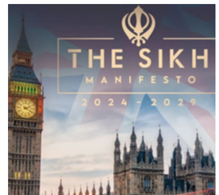
The Sikh Manifesto