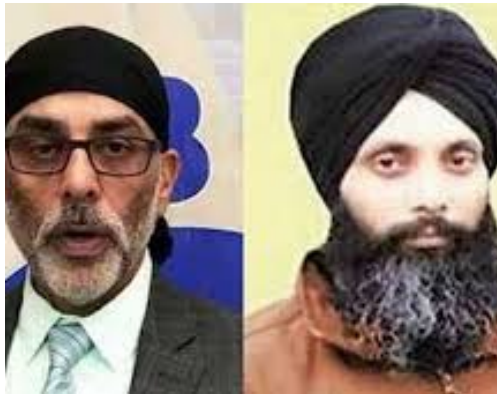
Khalistani terrorist and chief of the banned Khalistani outfit Sikhs For Justice (SFJ), Gurpatwant Singh Pannun, and Hardeep Singh Nijjar