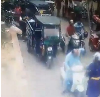
Punjab Shiv Sena leader attacked with swords in Ludhiana