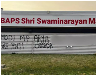
Hindu Temple Defaced In Canada