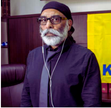
Gurpatwant Singh Pannun