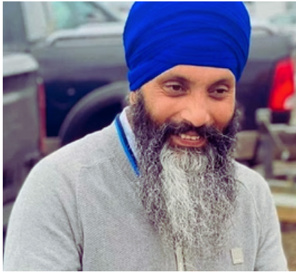
Hardeep Singh Nijjar