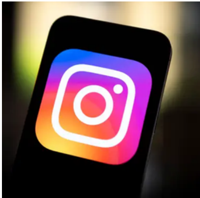
Meta reveals how the China-based network targeted India, Punjab and global Sikh community on Facebook and Instagram