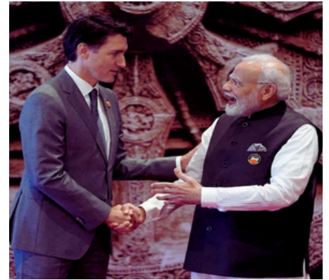
Canada report claims India trying to influence politics over Khalistan concerns