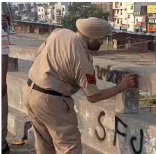
Day before PM's visit, pro-Khalistan graffiti appears at Patiala flyover