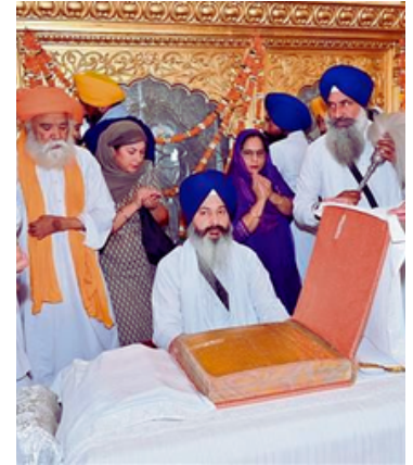
NIA arrests key accused in attack on Indian High Commission in London