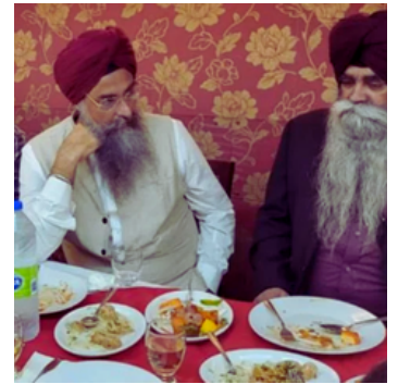
Khalistani Funding For AAP? Pictures of Top Party Leaders With BKI Terrorists Surface