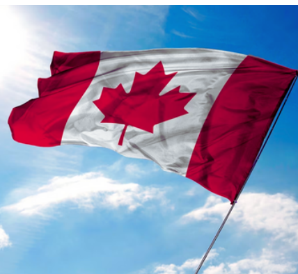
Canada again, floats target Indian leadership at pro-Khalistan rally