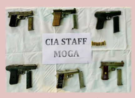
Moga Police recovered illegal weapons