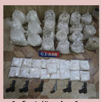
Confiscated Items from Cross-Border Smuggling Racket, Punjab