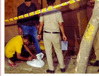
Cops probing Khalistan link in Delhi blast

A Khalistani group, Justice League India, claimed responsibility via a Telegram post on October 21 for the blast that occurred near the CRPF school in Rohini, North West Delhi. The post circulated online included a clip of the blast with a 'Khalistan Zindabad' watermark at the bottom, along with a warning of further attacks.