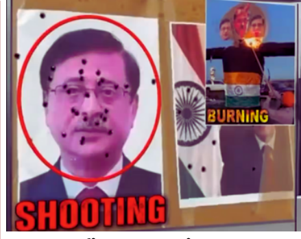
Bullets fired at Indian envoy to Canada's photo