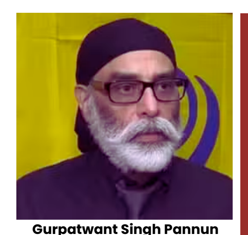
India still wants me dead, Biden's 'quiet diplomacy' won't work: Khalistani separatist Gurpatwant Singh Pannun.

Gurpatwant Singh Pannun, Khalistani terrorist and chief of the Khalistani outfit Sikhs For Justice (SFJ), banned in India, claimed in an interview in New York, United States (US), that Indian intelligence agents continue to target him. He also criticized the Biden administration's 'quiet diplomacy', stating that it has failed to hold Prime Minister (PM) Narendra Modi's government accountable and that the risk to his life has only increased.