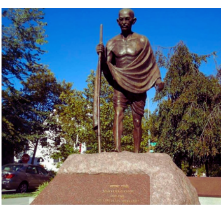
Mahatma Gandhi's statue in Washington